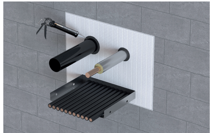
QuelStop Fire Batt used in conjunction with QuelStop HPE Intumescent Graphite Sealant around the pipes

Ensure that you install the QuelStop Fire Batt with at least 75mm overlap and fix it to the substrate with the minimum 80mm steel screws and penny washers at maximum 300mm centres overcoated with QuelStop Coating. Coat all joints using QuelStop Intumescent Acoustic Acrylic Sealant and ensure all leading edges of the QuelStop Fire Batt are coated with QuelStop Intumescent Acoustic Acrylic Sealant.