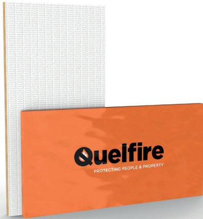
QuelStop Fire Batt

QuelStop Fire Batt is a coated mineral wool board used to reinstate the fire rating of wall and floor constructions where they have been penetrated by services.