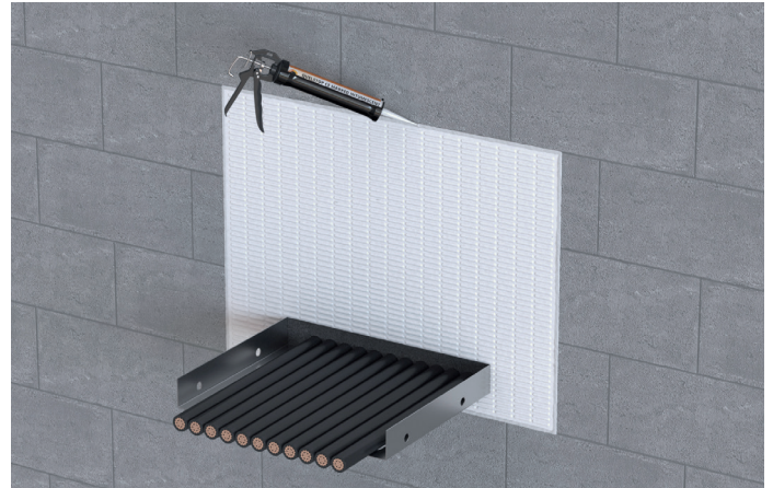
QuelStop Fire Batt used in conjunction with QuelStop Intumescent Acrylic Sealant