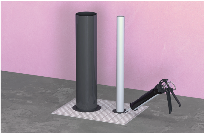
QuelStop Fire Batt used in conjunction with QuelStop HPE Intumescent Graphite Sealant